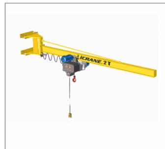
Wall Mounted Manual Swivel 180° Rotation