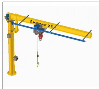
Self Supporting Motorized Swivel 270° Rotation