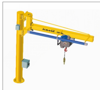
Self Supporting Manual Swivel Arm Up 330° Rotation